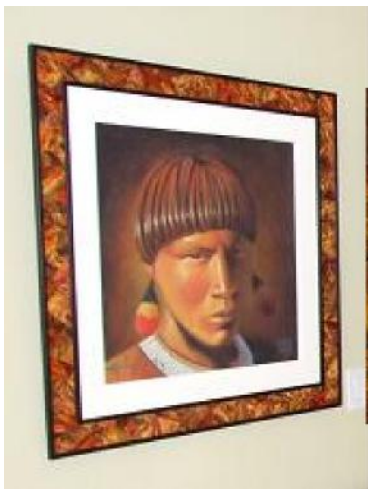
Faux Tortoise Shell