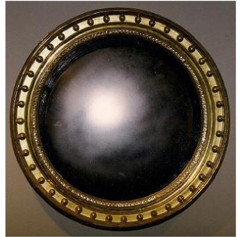
Water building using 24K gold on eyeball mirror frame