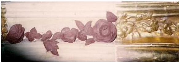
Expansion of queen size poster bed crown to king size – finished in 24K gold