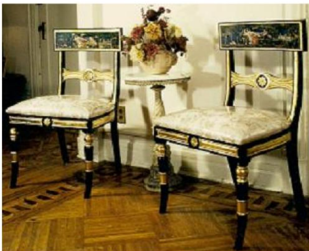
Original oil painting / gilding