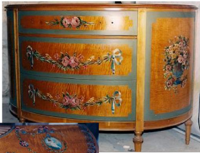
Original oil painting on curly maple – French polish