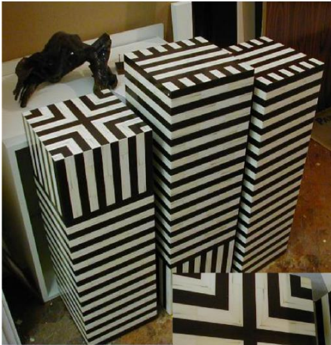
Faux Ivory with Wenge Veneer