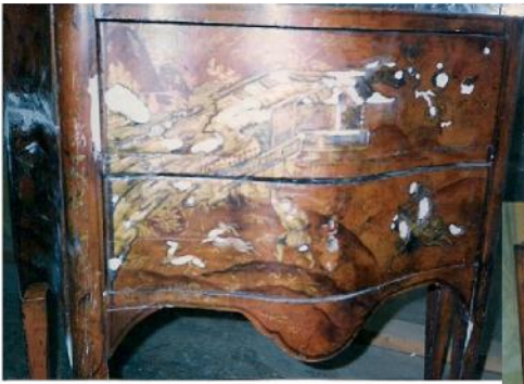
Restoration of 18 th century dresser with raised Japanese pattern