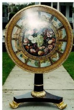
Oil painting on mahogany table inspired by magazine image